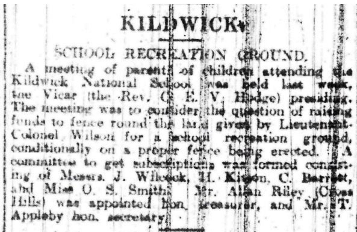
From Keighley News – 13/3/1920

Unfortunately, there was a small catch. The ground would have to be properly fenced off.