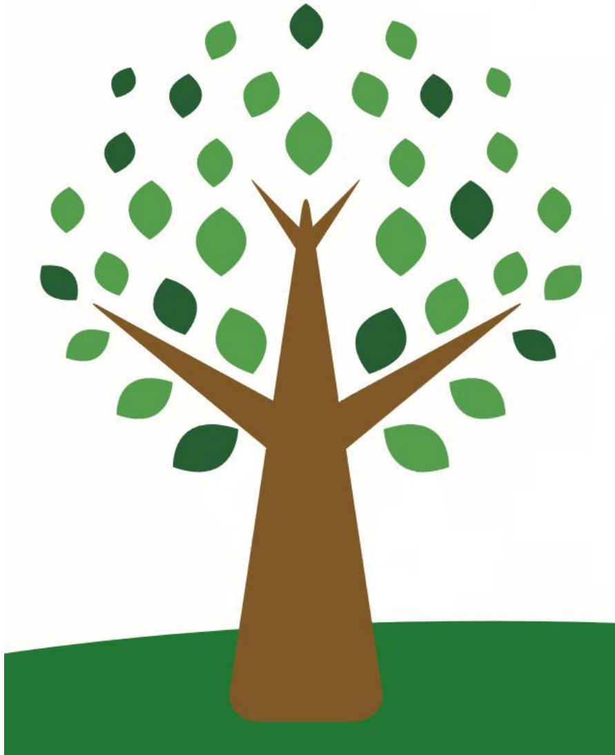
The logo of the Peggy Wilson Playing Field

It is the location of the Community Garden and provides an open space for the people of both villages.